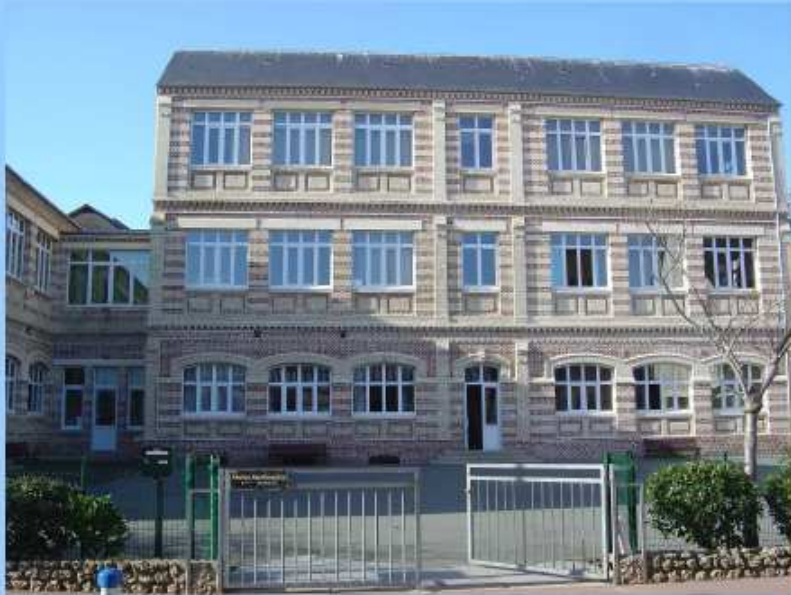
ECOLE PRIMAIRE FRACASSE