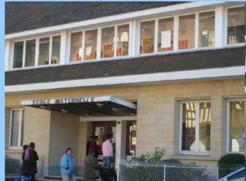
ECOLE MATERNELLE BRENEY